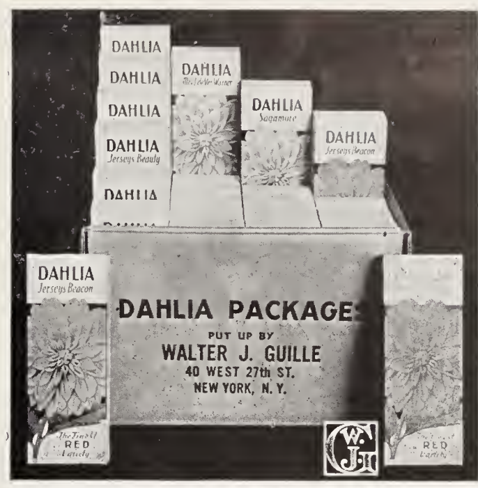
Carton of Packaged Dahlias

Price per carton of 25 (5 of each kind) $1.65